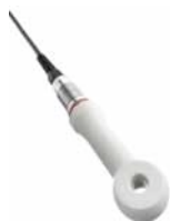
7250 PFA Inductive conductivity sensor suitable for measuring HF concentration

This concentration can be monitored using inductive conductivity instrumentation which allows measurement without any metal in contact with the fluid. The sensor consists of two adjacent coils encapsulated in a single polymer body. The first coil is energized with AC current. The fluid surrounding the doughnut shaped sensor induces a signal into the second coil in proportion to the conductivity of the fluid. This signal is then measured, temperature compensated and provided for display and control. Inductive conductivity sensors using PFA (perfluoro-alkoxy) and PTFE (polytetrafluoroethylene) wetted materials withstand the severe conditions of HF-containing baths.